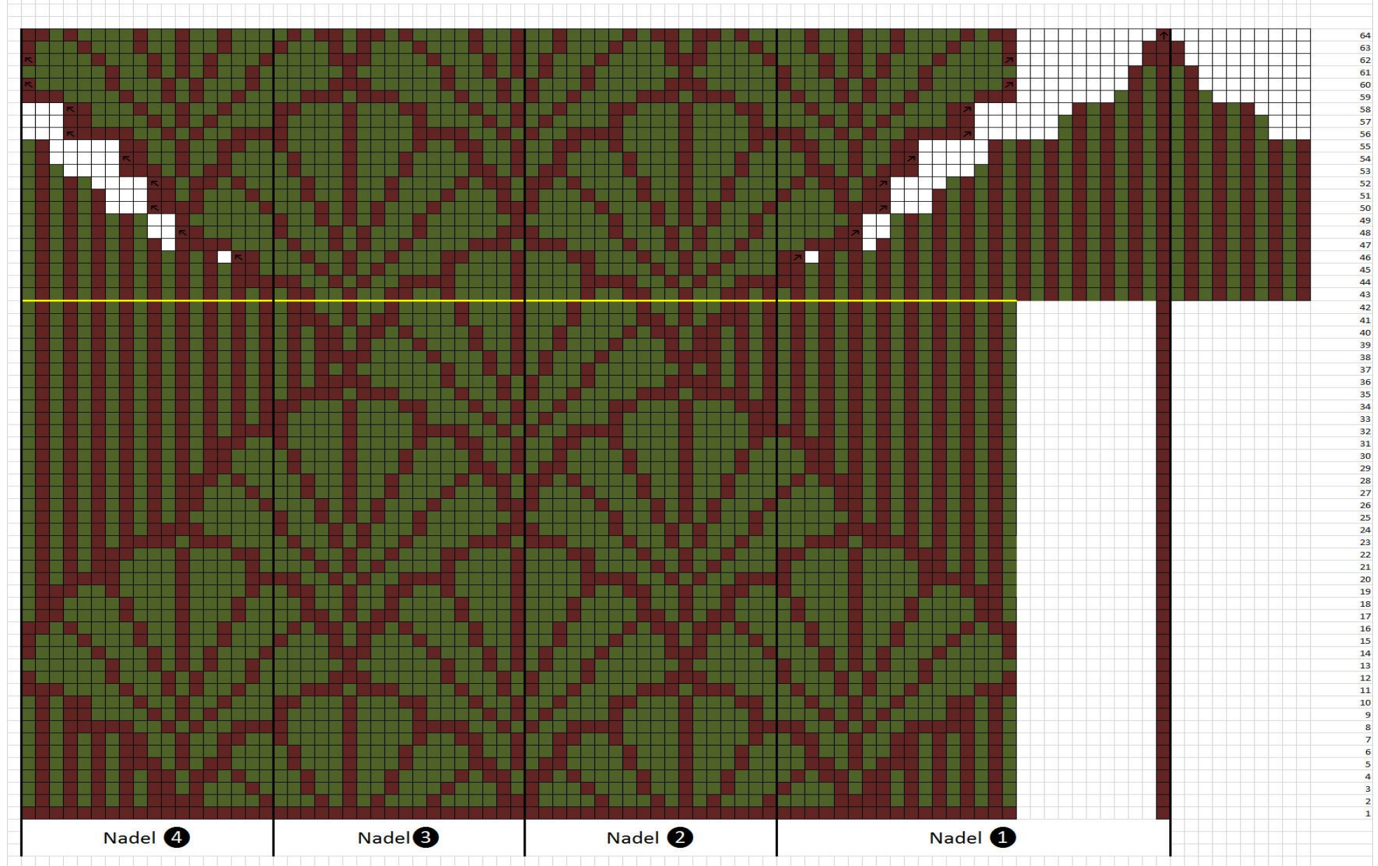
Chart Leg and Gusset / Bein und Zwickel